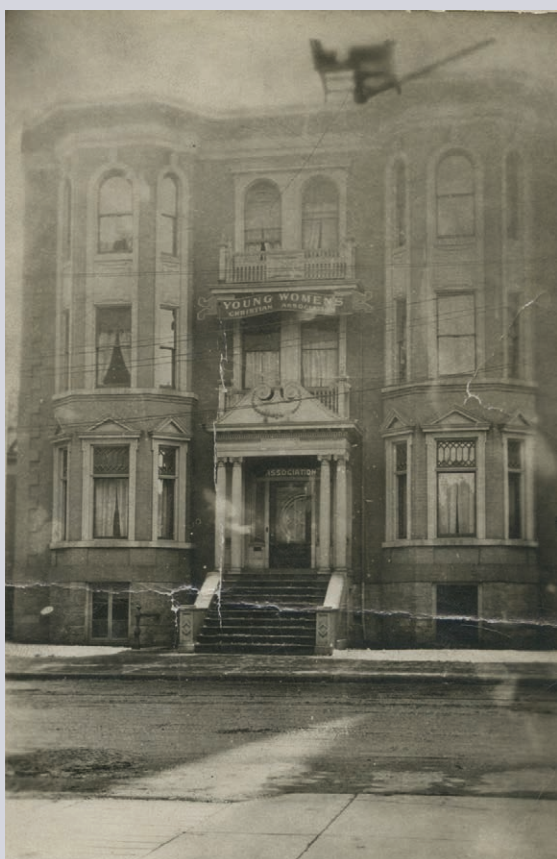
YWCA Hamilton 1910