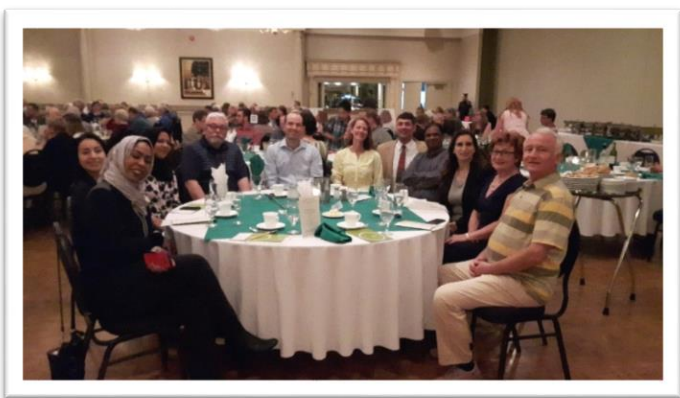
Pictured: Participants from our Environmental Occupations stream enjoy networking at the 'Environmentalism of the Year' Awards dinner.